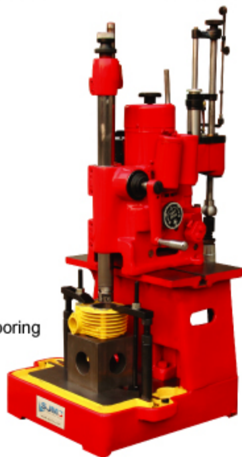
TM806 - boring