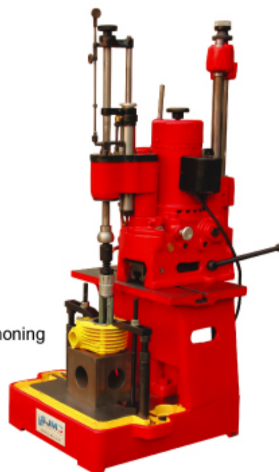
TM806 - honing